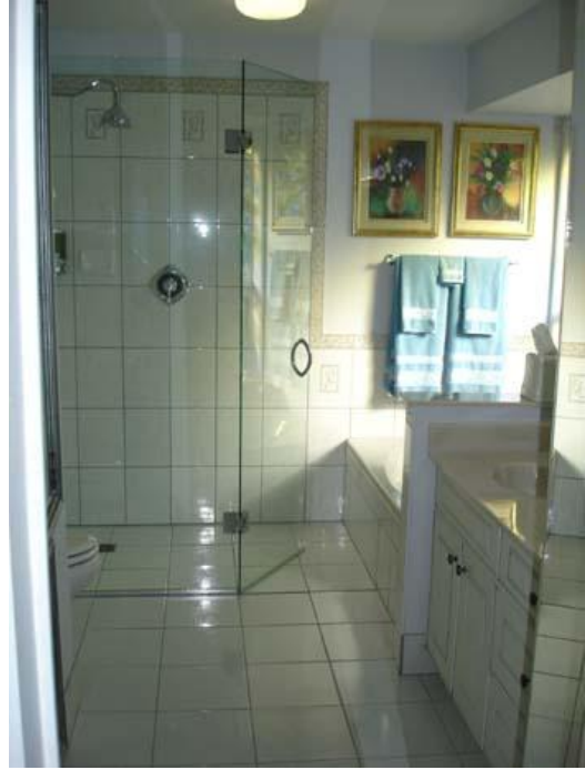
Brand New Bathroom Shower