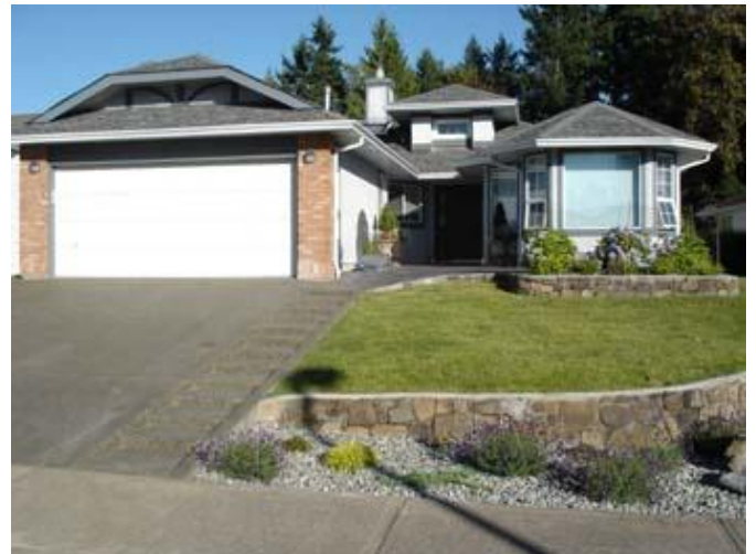
New Landscaping, Driveway, Steps (added). Beautiful Curb Appeal....Wow!