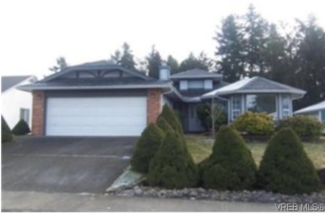
Old Landscaping hides the house. Old cracked driveway & no steps!