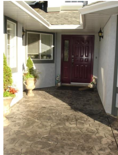
Newly Stamped Entrance to Front Door