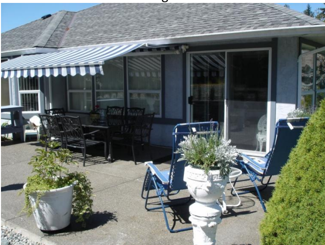
New Patio Concrete and New Roof