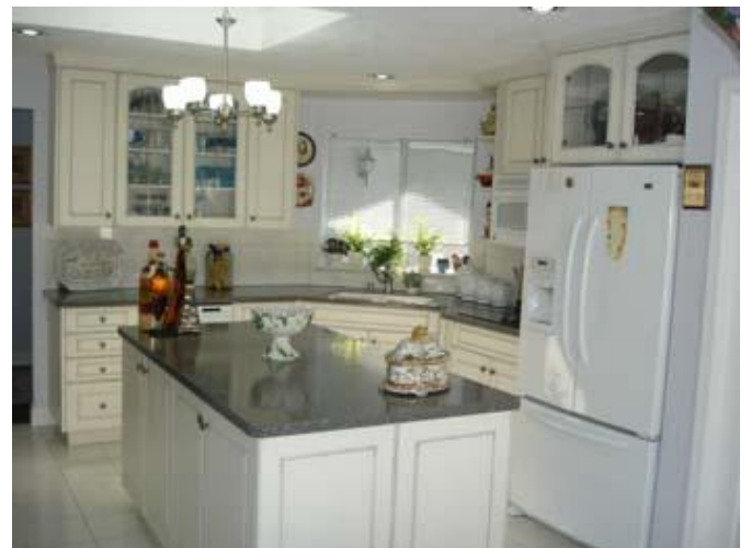
Brand New Kitchen (Cabinets, Appliances, Counter Top, Light Fixtures, Motorized Skylight & Tile Flooring)