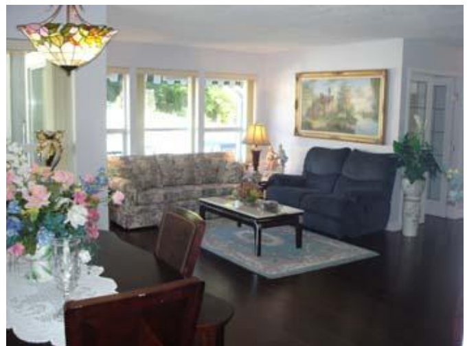
Living / Dining Room Combo