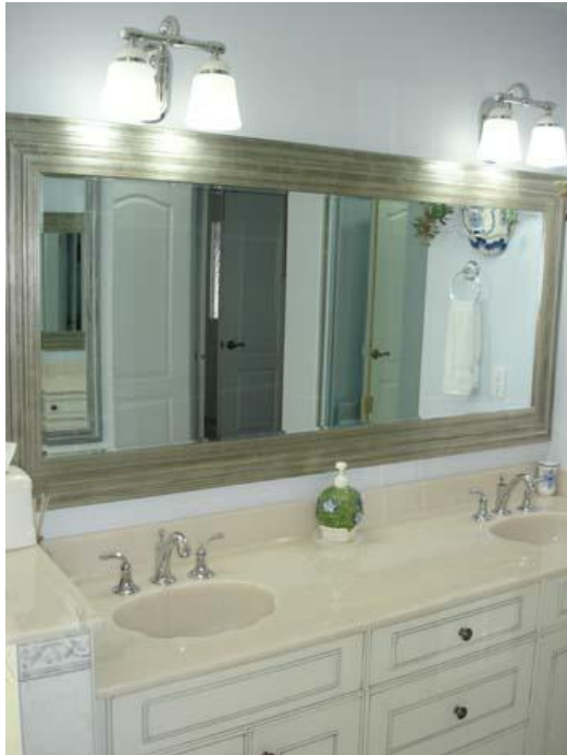
Brand New Vanity in Master Ensuite