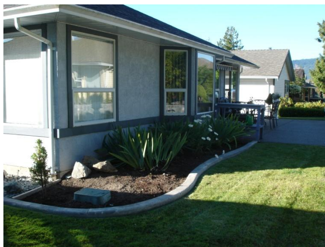
New Landscaped Backyard