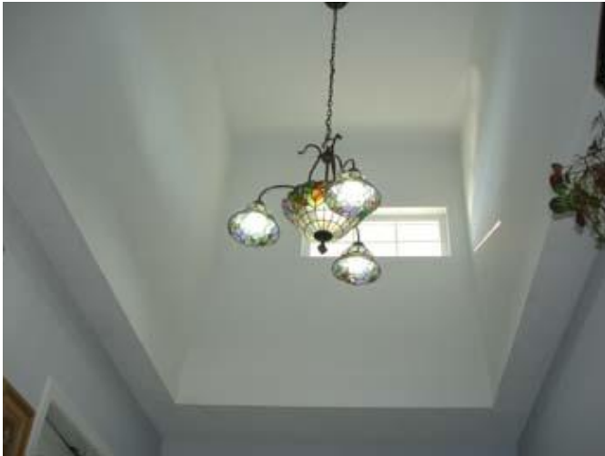
New Vaulted Ceiling with New Window & Chandler