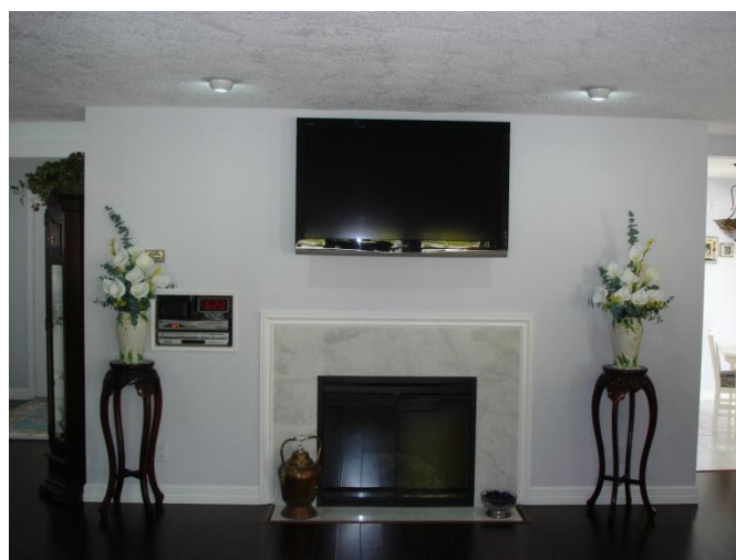
New Feature Wall New Electric Fireplace