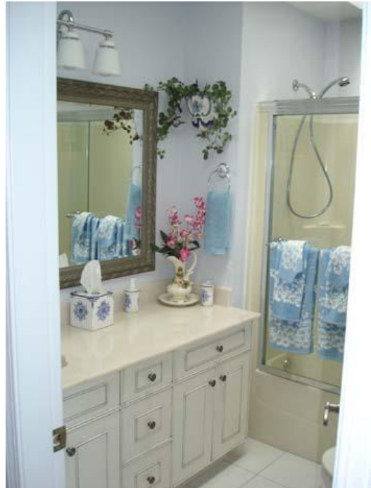
Brand New Vanity in Main Bathroom