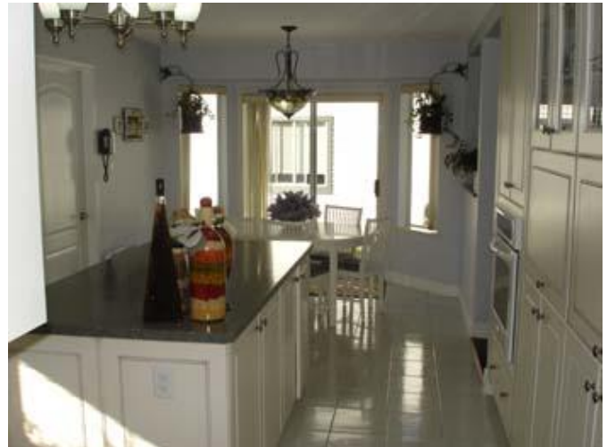
New Kitchen & Nook Area to Sliding Glass Door