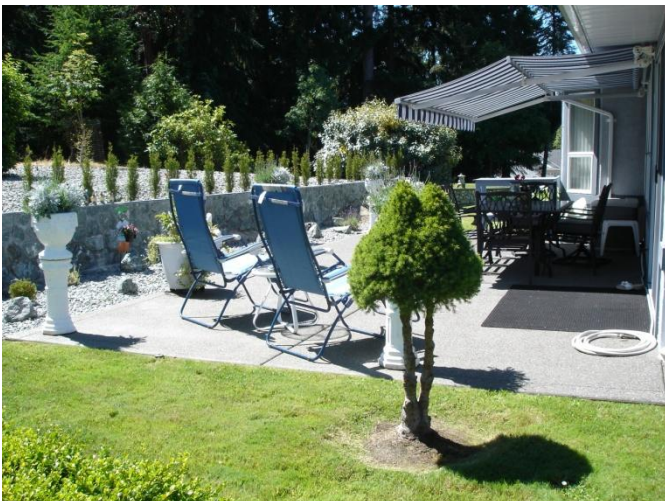
New Retaining Wall in Back