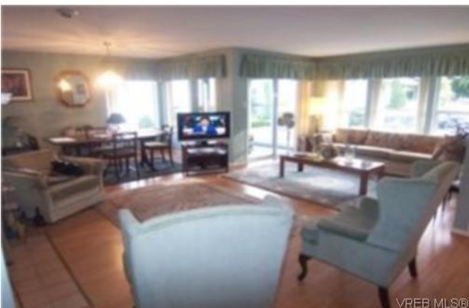
Old Living/Dining with Laminate Floors