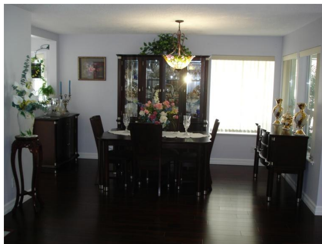
New Dining Room