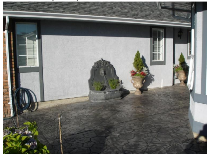
New Stamped Patio in Front