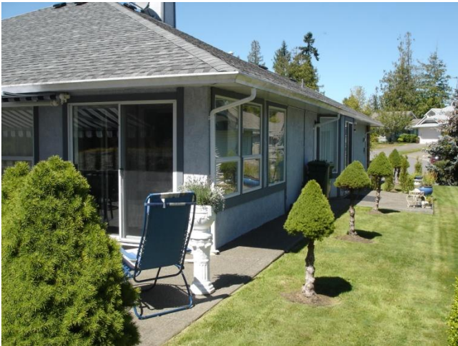
North side of House & New Roof