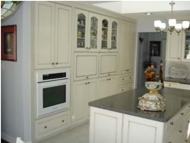
Additional Cupboard Space & Motorized Skylight which wasn't there before.