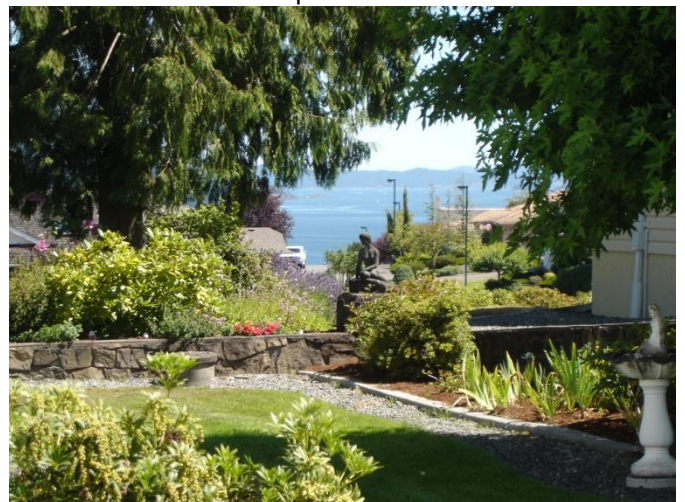
Ocean view from Patio & Sunroom