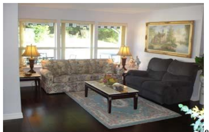
New Living Room with Hardwood Flooring