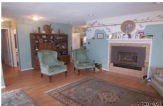
Old Feature Wall – Teal Green with Vine Mural Old Wood Fireplace with Insert