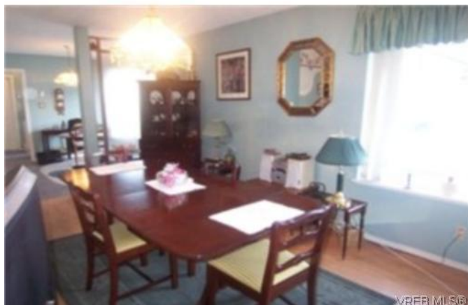
Old Dining Room with Teal Green Walls & Laminate Flooring